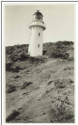
Kathurangi Point 1930